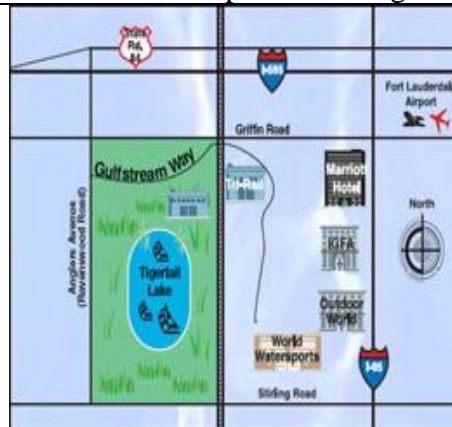
Tigertail Lakes Center