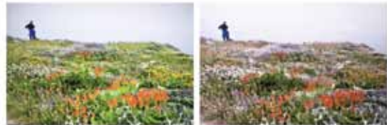
High color light output