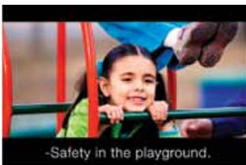
-Safety in the playground.