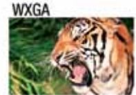
1280 x 800 Offers the highest quality and is ideal for widescreen (16:10 aspect ratio) display