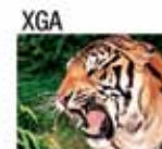
1024 x 768 Ensures sharper detail