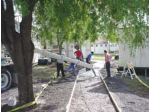
Facilities staff working on the installation of a new sidewalk off the back of modular 87 - another great job!