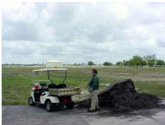
Lori Labontee busy transporting soil to plant annual flower beds in various locations around campus.