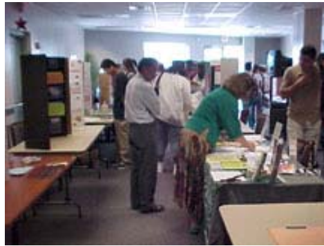
Part of the crowd viewing the Earth Day exhibits