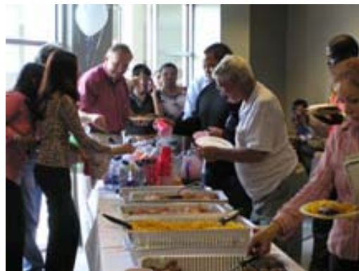
Members of the group, including Senor Buford, enjoying the meal