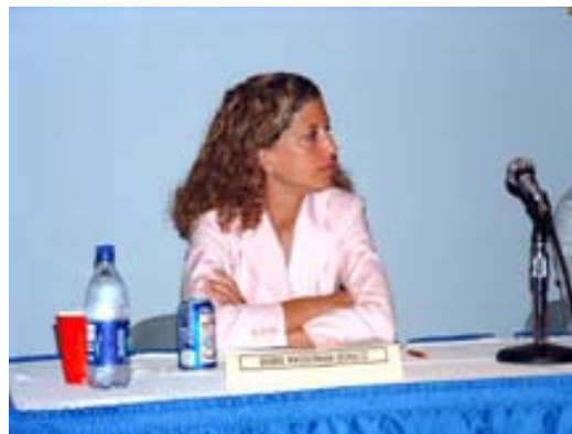
Debbie Wasserman-Schultz (D)

Candidates responded to questions that had been prepared for them (as well as to each other), and then the audience had the chance to also suggest questions. Clear differences were seen among the candidates, and students came away with a clearer understanding of their positions on a number of issues.