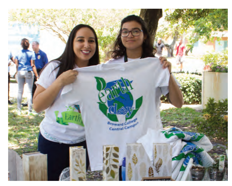
Members of Student Life proudly display Earth Day shirts at the Agriculture and Science Expo.

The Broward College Science, Technology, Engineering and Math (STEM) programs hosted the Agriculture and Science Expo at Central Campus. The community event brought together exhibitors from a number of organizations working in the field to display innovation and new technology. Festivities included a kids play area, petting zoo, games, food and products for sale. The endeavor was funded as part of a grant from the National Science Foundation (NSF) to foster outreach to the community and help enhance public understanding of environmental and agricultural science. It was among a number of events across the College in celebration of Earth Day. There was everything from a Bee Day and park clean-up to an environmental film festival.