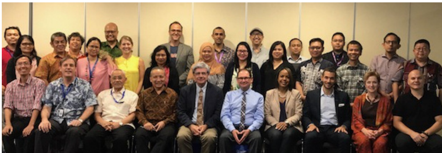
Members of the Broward College delegation with attendees at the training at Sampoerna University American College (SUAC) in Jakarta, Indonesia.

A five-member delegation from the College was in Jakarta, Indonesia from July 14 – 17 to offer training to faculty and staff at Sampoerna University American College (SUAC) on administrative matters, program structure and course delivery. SUAC will become the newest international partner for the College, pending approval by the Board of Trustees.