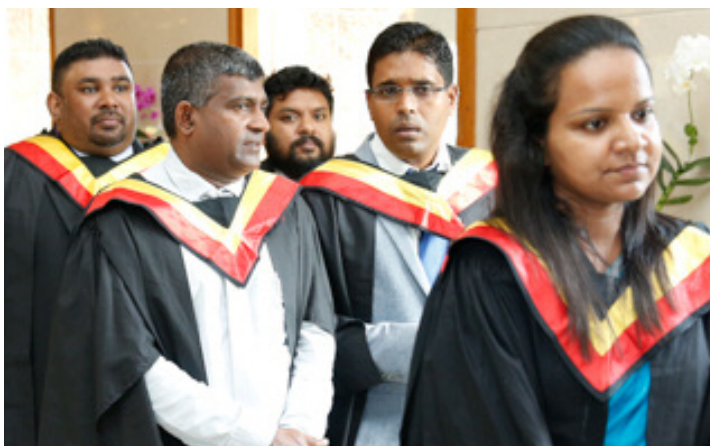
Graduates take part in the processional at the 2017 Broward College and American Higher Education transfer and graduation ceremony.