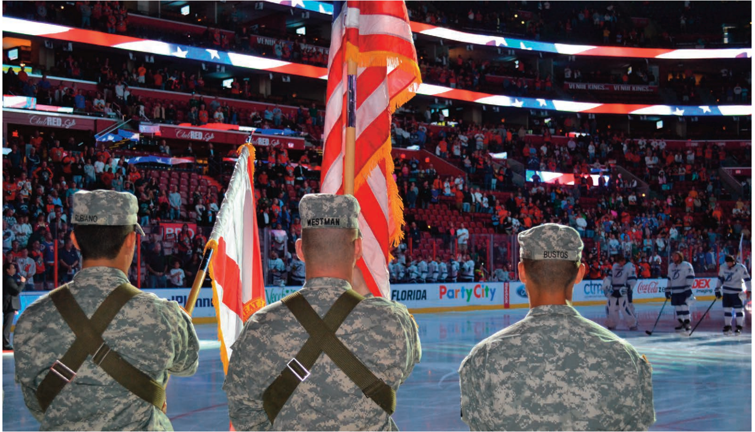
Broward College Army ROTC students served as the color guard for a Florida Panthers NHL hockey game earlier this season.