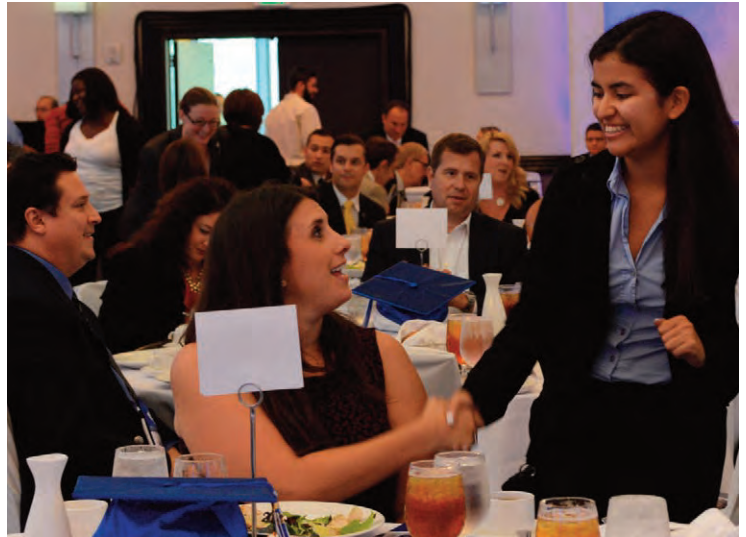
Midway through the program, currently enrolled Broward College students joined guests at their tables to share their personal stories about the power of higher education.

Broward College Student Ambassadors, nursing students who demonstrated patient simulators, dancers from the Visual & Performing Arts Department and members of the Phi Theta Kappa Honor Society were also in attendance.