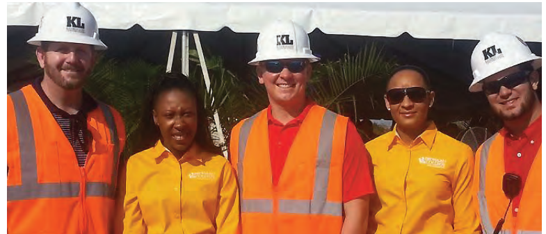
South Campus Student Ambassadors assisted in the ceremony and guiding guests on the construction site.