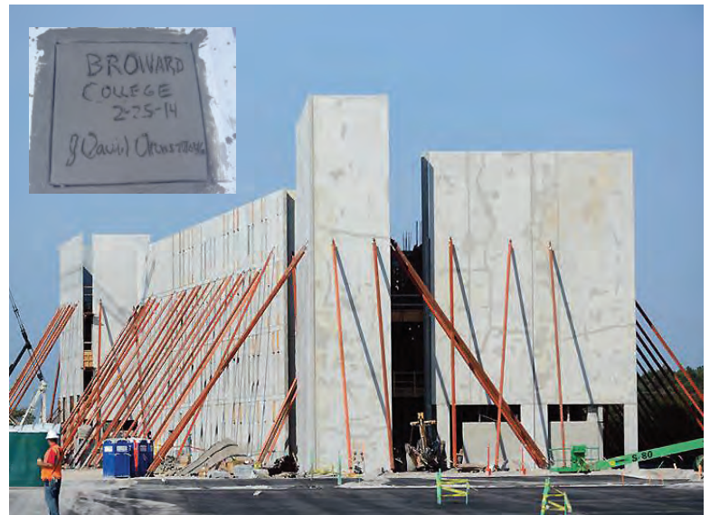
The four-story, joint-use facility will house two floors of Broward College programs and two floors of FIU programs. The center will open for classes in Fall 2014.