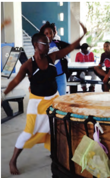
South Campus: Dance Across the African Diaspora event.