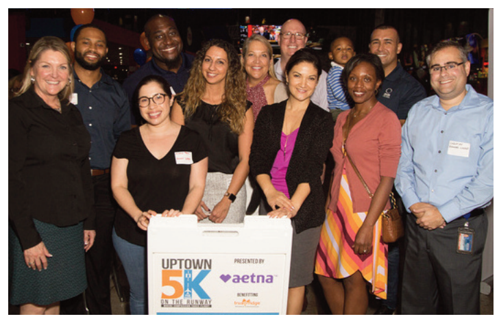
College employees at the launch party at Xtreme Action Park, Fort Lauderdale, on February 11.

Broward UP and College's Aviation Institute are co-sponsoring the event, scheduled for April 18 on the runway of the Fort Lauderdale Executive Airport (FXE). The Annual Uptown 5K celebrates aviation, the Uptown community (residential and commercial areas in the 33309 zip code), and compassion towards others. The Uptown 5K features an Urban Village with live entertainment, a kids' zone, and an interactive aviation tent, offering the College the opportunity to promote its programs including Broward UP courses to an anticipated 2,000 participants.