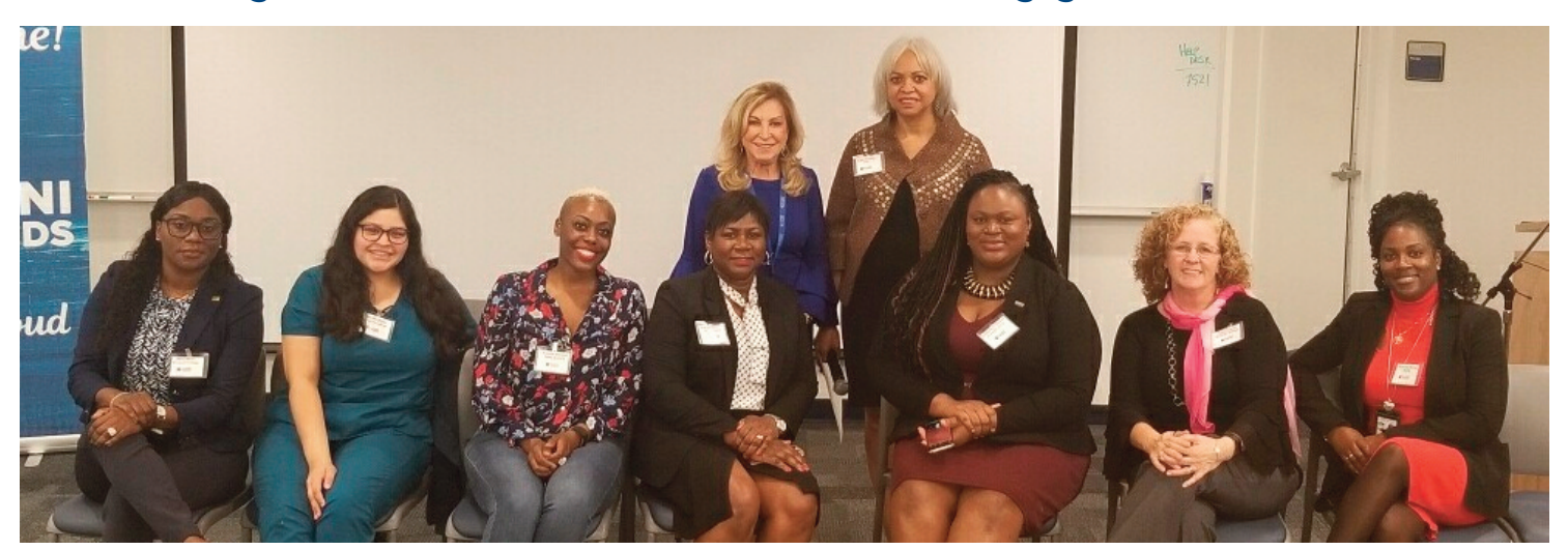
Women of Tomorrow Career Panel

On January 28, the Network hosted a Women of Tomorrow Career Panel on the A. Hugh Adams Central Campus in Davie. Broward College alumnae met with prospective students from Dillard and Western High Schools, sharing professional advice and encouragement. Also, on February 5, the Network hosted a Speed Mentoring session for students on Central Campus. Mentors shared stories of studying at Broward College, and mentees rotated between mentors, allowing each student to receive information from a diverse group of people with different backgrounds, career paths, and experiences.