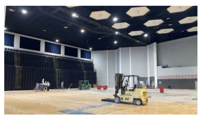
The Omni Auditorium under construction.

The indoor pickleball facility at the North Campus is under construction and expected to be completed in May. In December 2022, the Broward College Board of Trustees voted to authorize a lease agreement with Diadem Pickleball, a Pompano Beach-based racket sports company, to convert parts of the Omni Auditorium on Broward College's North Campus into the region's first indoor pickleball facility. The proposed DIADEM Omni Pickleball Complex Indoor Arena at Broward College will include eight indoor courts and food and beverage offerings. It will be open to the public with hours of operation between 7 a.m. and 10 p.m. It will also include national broadcasting and co-branded marketing opportunities and discounts to students and staff.