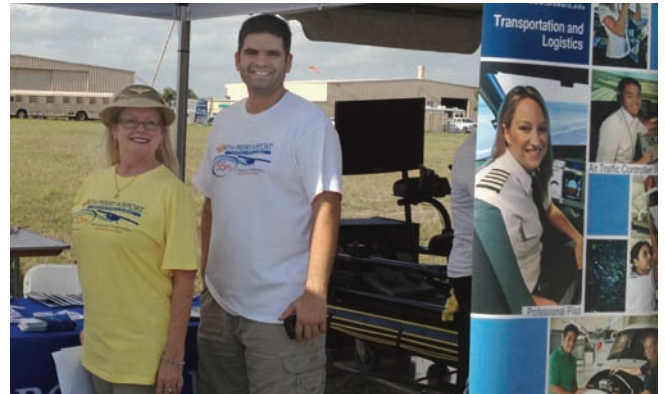
North Perry Airport's 55th anniversary celebration.

On May 11, the Aviation Institute helped North Perry Airport celebrate its 55th anniversary with an open house and tours from 9 a.m. to 3 p.m. The family-friendly activities also included helicopter and discovery flights, vintage airplane displays and more than 30 aviation-related companies and organizations.