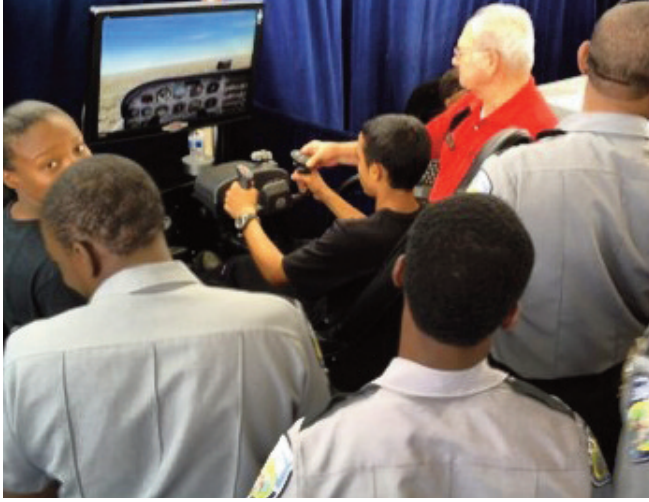
Operation SAFEE Flight event.

Broward College's Aviation Institute has been on the go in recent weeks.