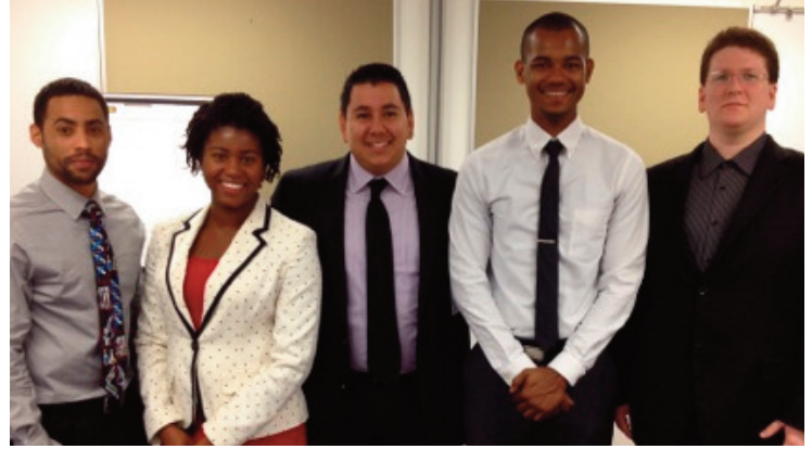
Newly hired TEP Math & Science teachers.