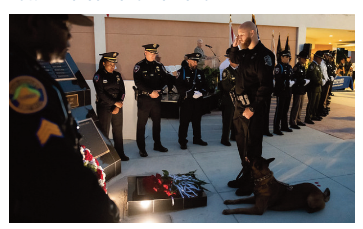
A police officer salutes the plaque with names honoring law enforcement officers who lost their lives in the line of duty at the Annual Law Enforcement Memorial Ceremony, April 24, at A. Hugh Adams Central Campus. The names of the fallen officers are engraved on the concrete memorial between Buildings 21 and 22.