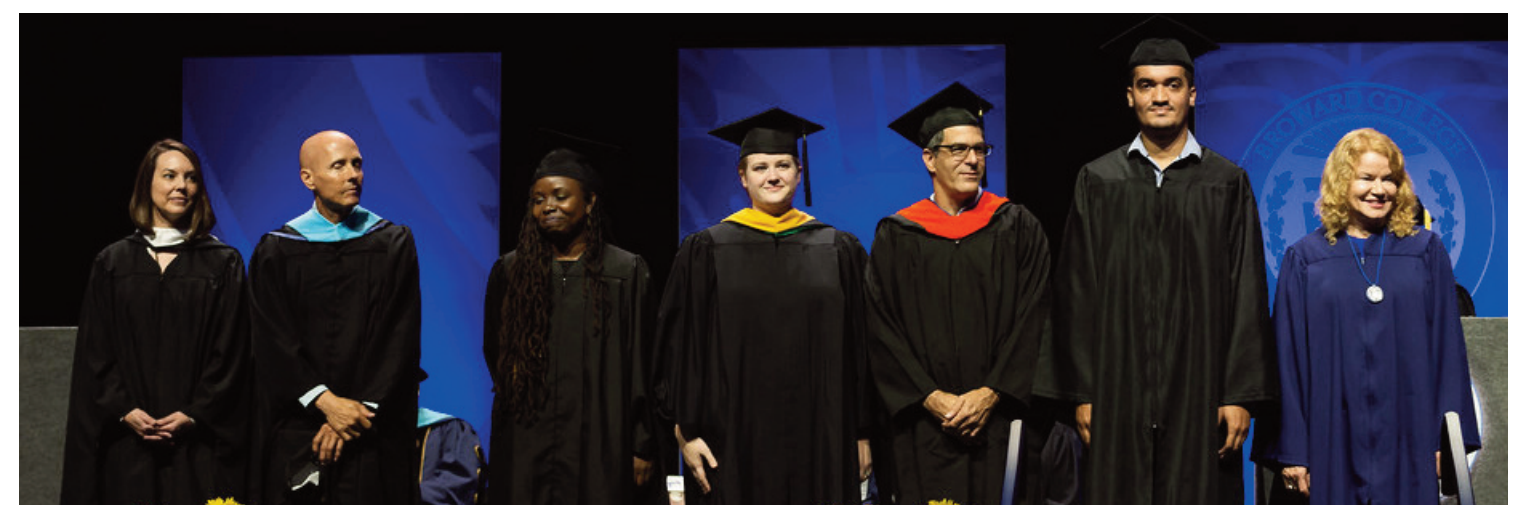
Some of the Professors of the Year during their recognition at the spring commencement ceremony.

The College recently recognized 12 full-time and part-time faculty as outstanding Professors of the Year. The faculty members were nominated by their peers or students and reviewed by a committee on each campus.