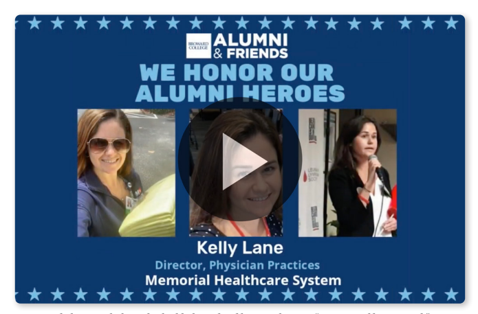
{\it Click to watch this video highlighting local heroes who were ``Empowered by Broward."}

The individuals profiled are a few examples of the impact of Broward College graduates, including those working in areas outside of healthcare and nursing. It is estimated that 70 percent of the individuals working on the frontlines against coronavirus have a degree from a community college across the nation. Their stories remind us of how vital Broward College and our graduates are to the health and vibrance of our economy.