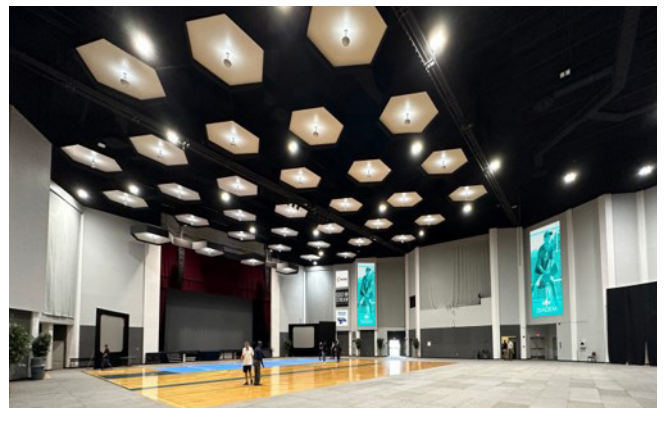
The Omni auditorium will house an indoor pickleball facility containing eight courts.

During their monthly meeting on Tuesday, December 6, the Broward College Board of Trustees voted to authorize a lease agreement with Diadem Pickleball, a Pompano Beach-based racket sports company, to convert parts of the Omni Auditorium on Broward College's North Campus into the region's first indoor pickleball facility. Pickleball is one of the fastest-growing sports in the world, with 6.8 million players in the United States alone. The sport showed a 23 percent growth last year, with age demographics shifting significantly younger. The proposed DIADEM Omni Pickleball Complex Indoor Arena at Broward College will include eight indoor courts and food and beverage offerings. It will be open to the public with hours of operation between 7 a.m. and 10 p.m. Discounted rates will be available for Broward College students, faculty, and staff. It will also include national broadcasting and co-branded marketing opportunities. The proposed contract estimates $2.9 million in net revenue to the College.