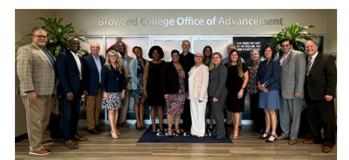
Pathway deans with representatives of the Office of Advancement.

On Monday, October 17, 2022, the Office of Advancement hosted a Pathway Dean's Collaborative Meeting at the Willis Holcombe Center, where colleagues discussed fundraising ideas aligned with the Social Enterprise Plan. This meeting also allowed the Advancement team to reconnect with deans and introduce them to gift officers. Each dean now has a gift officer liaison with whom they will work closely to provide the fuel to advance the Social Enterprise Plan tactics.