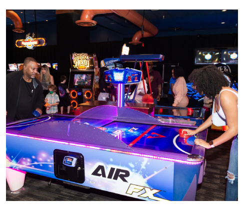
Broward College staff, faculty, and their family members celebrated the conclusion of a successful year with an evening of games, food, drinks, and dancing.