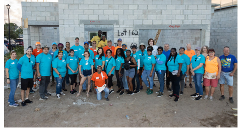
Broward College faculty and staff participated in a BC Cares event with Habitat for Humanity in Pompano Beach.

On Saturday, December 3, the College re-opened BC Cares events to the families of faculty and staff for a volunteer event at the historic Dorsey Riverbend at Provident Park. Through a partnership with Action for Literacy and the City of Fort Lauderdale, approximately 68 participants collected more than 500 pounds of trash from the surrounding neighborhood and painted 20 mini-libraries for community members to donate and take home books. Attendees also had the opportunity to tour the new YMCA facility located across the street from the park.