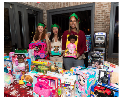
Toys collected during the End-of-Year Celebration will be given to children in support of the Jack and Jill Center.