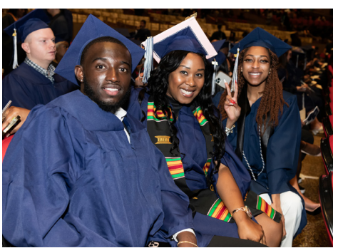
Broward College associate degree students celebrate at the Hard Rock Live in Hollywood.