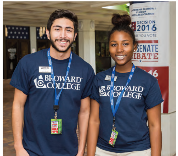
Debate volunteers included student ambassadors, student government representatives, and political science students.