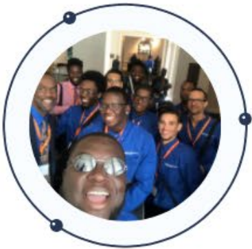
MINORITY MALE INITIATIVE