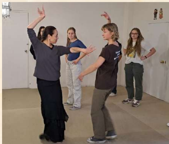
Learning to dance Sevillanas

of hopelessness; a dance so complex, how could I possibly remember it all? Whereas others I left with pride, having made it through the whole Sevillanas without forgetting more than a few steps. Each time the group would meet, my confidence grew. Not necessarily because my skill was growing, but rather because I was more comfortable making mistakes.