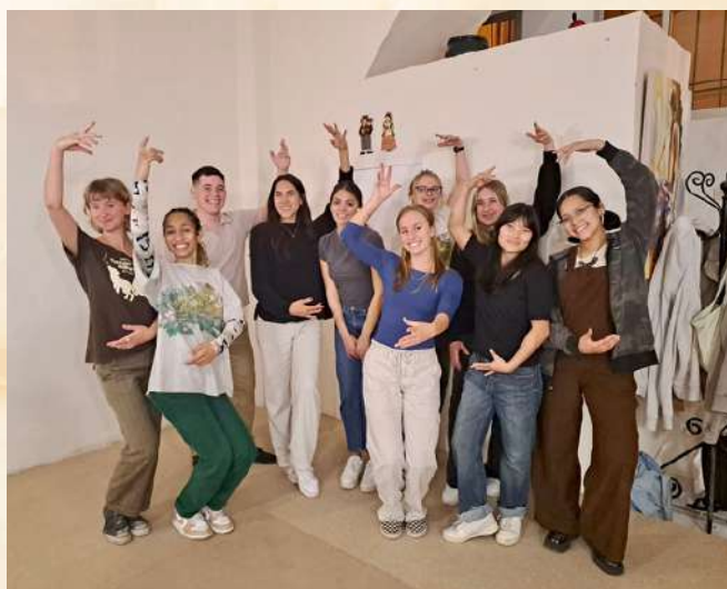
Ready for the April Fair!

After taking the risk, signing up for the class, and potentially subjecting myself to awkward discomfort, I was rewarded with a sense of belonging. This feeling is infectious, and I've continued to dive deeper. I've been taking flamenco guitar lessons, attending local jam sessions, and the ultimate goal of friendship and community has begun to find its way in. By taking an interest in such an important cultural tradition, living here has started to make more sense. The best decision I've made this semester is to jump headfirst into things I want but have always been too scared to reach for. I've chosen to open my heart and mind to another culture, and in return, Sevilla has begun to embrace me as well.