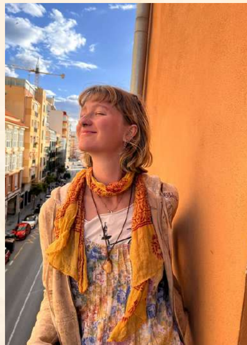
In my Seville home

Since studying abroad, a feeling that I've heard expressed by other students is alienation. There's inevitable disappointment when the fantasy you created in your mind prior to leaving the U.S. doesn't manifest exactly into your reality. I am myself guilty of allowing this phenomenon to take hold. I imagined my life in Spain to be accompanied by local friends, taking me under their wing and showing me the ins and outs of Sevilla. What I and I'm sure many other students abroad have found is that a sense of belonging in a foreign place isn't immediate. Truthfully, it's taken me over a month to start feeling like I'm getting the hang of life in Sevilla. That being