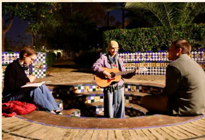
Playing Flamenco guitar.

said, if you continue to prioritize aspects you wanted to gain from study abroad, it's likely they will find their way in, in some form or another. For me, this goal was to experience and actively participate in Spanish culture.