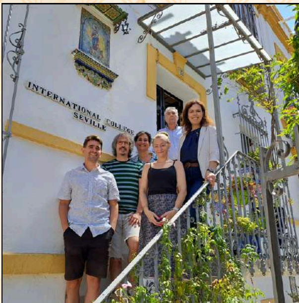
The ICS Team