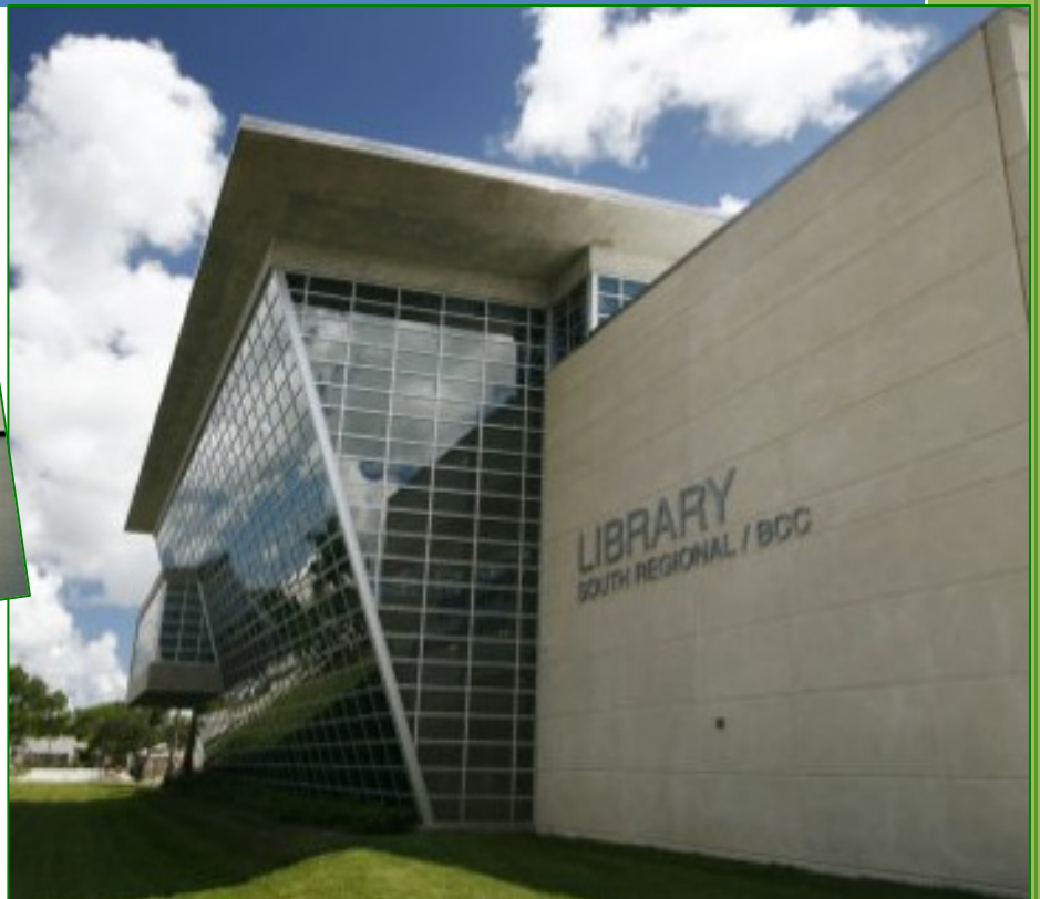
2007 -First LEED certified building - Broward County Broward County South Regional Library 7300 Pines Blvd, Pembroke Pines

REGISTER TODAY! www.broward.edu/seminars