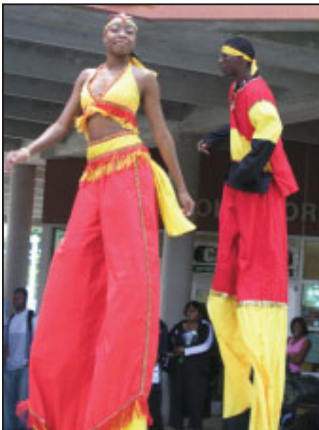
U.S. Virgin Islands' Mocko Jumbie Stilt Dancers entertain at North's Multicultural Festival.