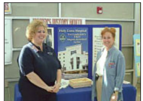
Holy Cross Hospital was one of 15 employers attending Central's Career Day.

Who could turn down free Krispy Kreme doughnuts and a chance to rub elbows with some of South Florida's top employers in the business, healthcare and computer industries? Dozens of students and BCC employees attended Central Campus' Career Day on March 23. Held in the Student Affairs building, the event was the last in a series of five mini job fairs that targeted specific industries and professions.