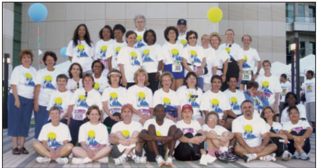
2004 Corporate Run —Dozens of enthusiastic BCC employees crossed the finish line in the seventh annual Fort Lauderdale corporate walk/run April 1 at the Office Depot Center. Proceeds from the 3.1-mile event benefited the South Florida Chapter of the Leukemia and Lymphoma Society.